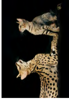
SERVAL & SAVANNAH (L & R)

So even if you find a willing vet, you will need a backup vet for if your vet is not working that day, is sick or on vacation, and you also need an emergency clinic that can deal with your special kitty. Nothing more terrifying than your beloved cat being desperately ill and not being able to get them lifesaving help.